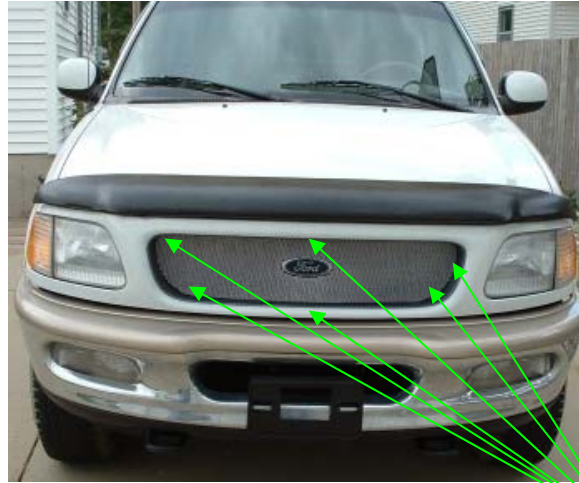
Wire Tie Points

Materials needed: Grills (included) Metal Wire (included) Wire Cutters Screwdriver Pliers